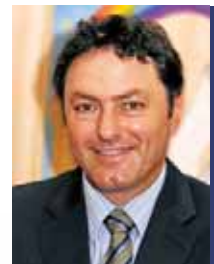
Executive Director of Celebrate Messiah Australia