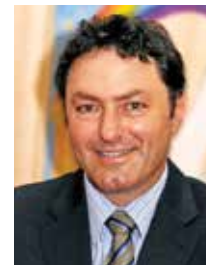
Executive Director of Celebrate Messiah Australia