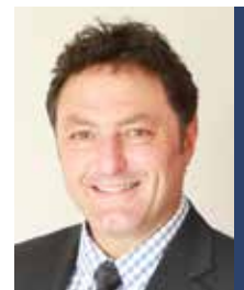
Executive Director of Celebrate Messiah Australia

design plan whereby we keep some of the existing structure. The new anticipated cost of the project will now be just below two million dollars, saving more than 50% off the original projected cost.